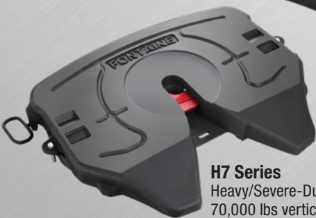
H7 Series Heavy/Severe-Duty 70,000 lbs vertical load Up to 180,000 lbs GCW