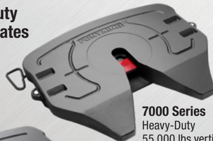
7000 Series Heavy-Duty 55,000 lbs vertical load Up to 140,000 lbs GCW